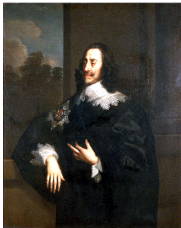
King Charles I English School, 1660

King Charles I was particularly good at representing himself in a positive light portraying himself as monarch, warrior, gentleman and family man. A very short man, Charles would often be shown to appear taller: on a horse, standing on higher ground or standing next to his even shorter wife.